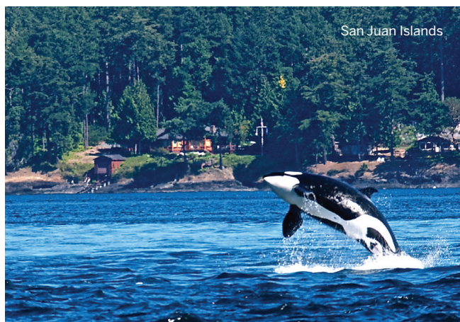
San Juan Islands

alpaca farms or watch pods of orca whales pass in front of your kayak. Orcas Island, often called the Emerald Isle, is arguably the loveliest of the main islands and also the busiest. But busy is a relative term. This pastoral community has no traffic lights and no fast-food restaurants. Stay at Doe Bay or Rosario Resort; Rosario is the more luxe option on over forty acres of waterfront property. Doe Bay appeals to the naturalists (the hot tubs are clothing optional). visitsanjuans.com