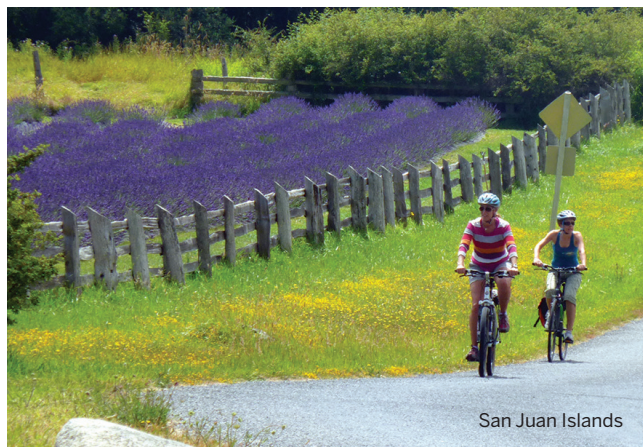
San Juan Islands

Leave your flip-flops behind and pack your hiking boots for a visit to the San Juan Islands north of Seattle. Nature lovers flock to the three largest islands, Lopez, San Juan and Orcas. These islands have no palm trees or coconut drinks. Instead they offer the untouched beauty of the sea and forest. Visit lavender and