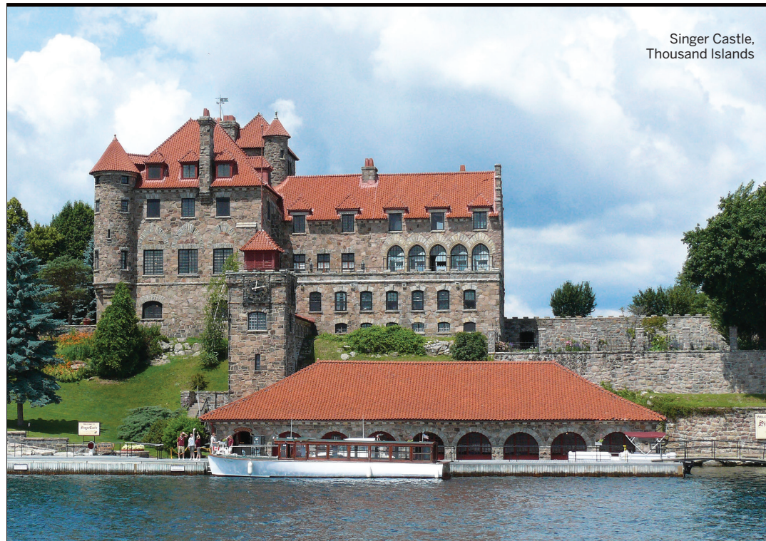
Singer Castle, Thousand Islands