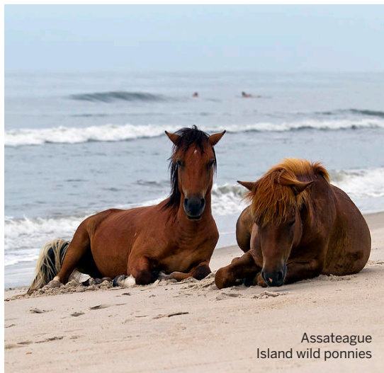
Assateague Island wild ponies