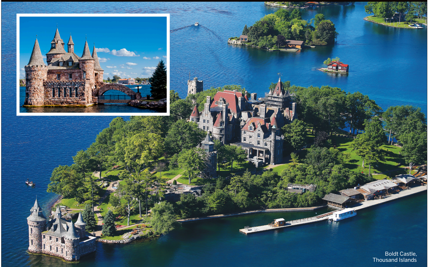
Boldt Castle, Thousand Islands