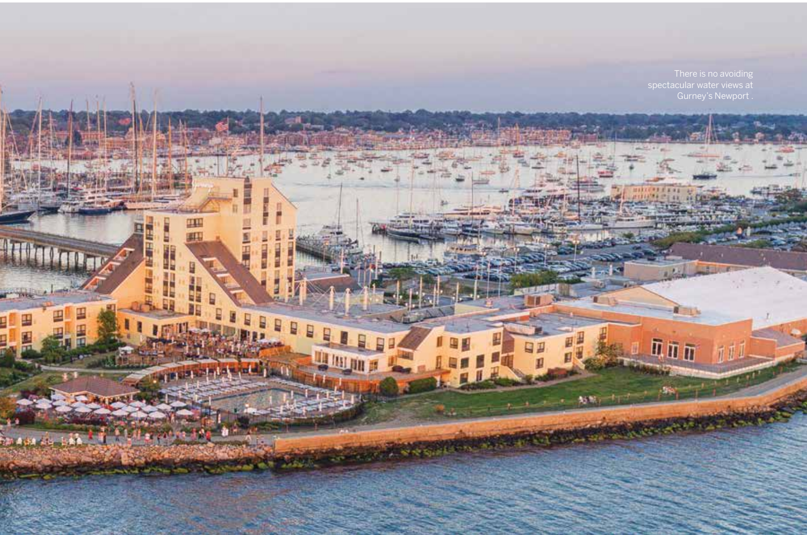
There is no avoiding spectacular water views at Gurney's Newport .