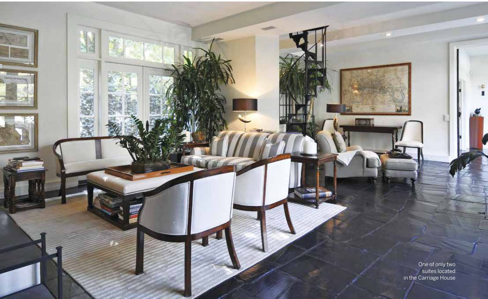
One of only two suites located in the Carriage House