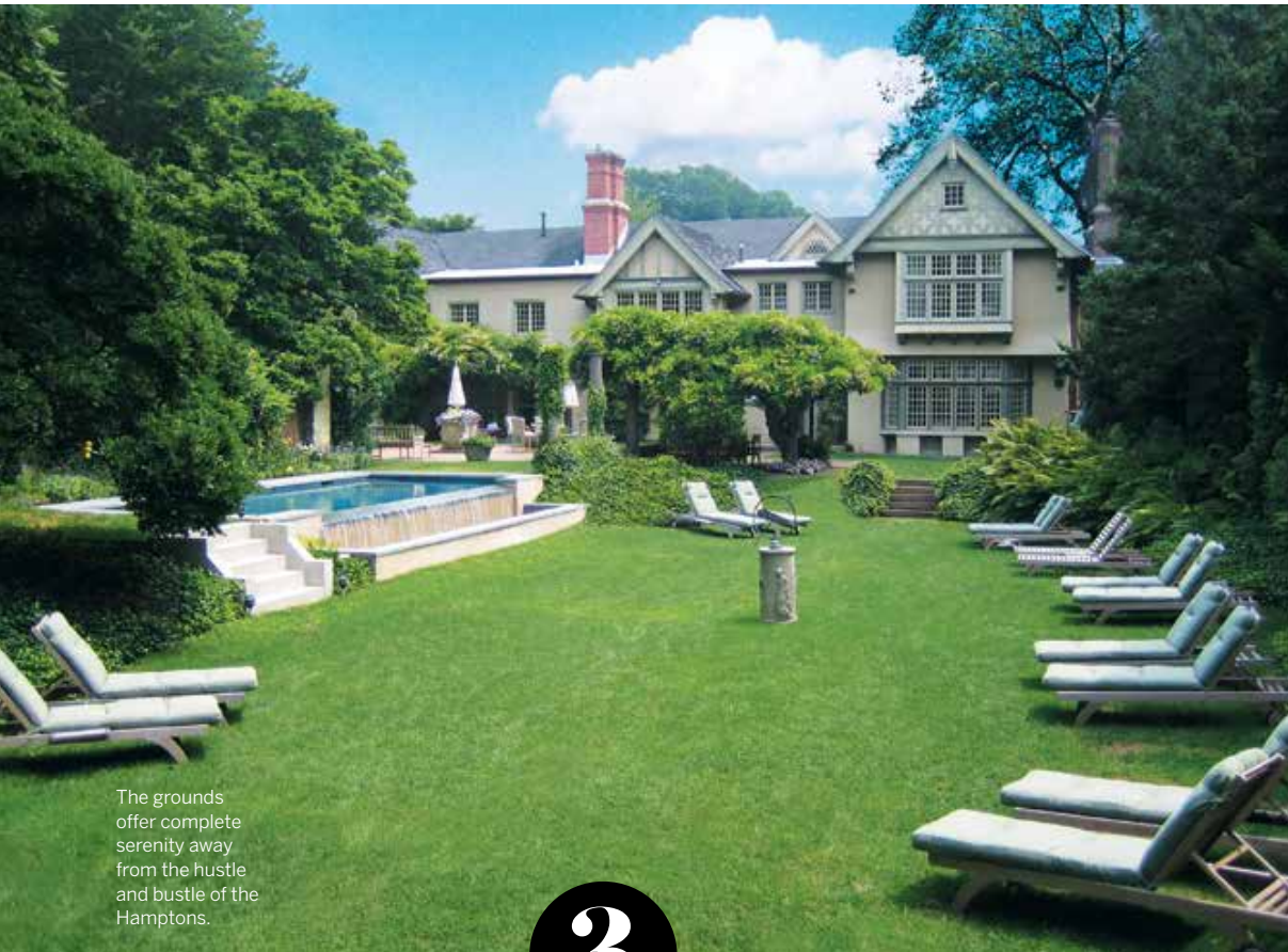
The grounds offer complete serenity away from the hustle and bustle of the Hamptons.