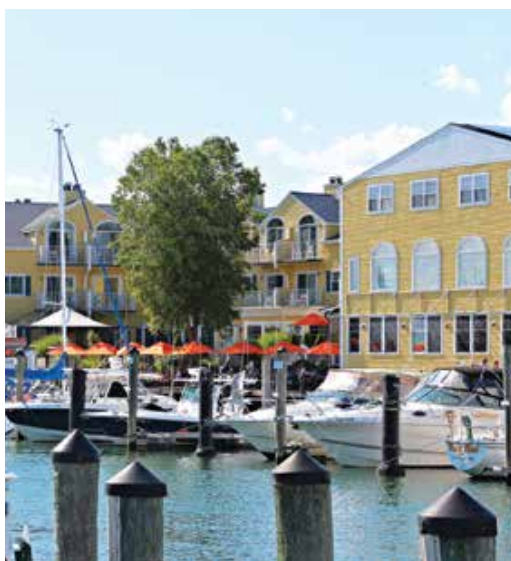
Saybrook Point Marina

Old Saybrook is just about a one-hour drive from Greenwich.