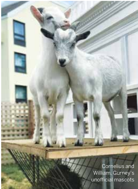
Cornelius and William, Gurney's unofficial mascots

The hotel offers 257 rooms, but there's a spot for everyone to grab a cocktail and enjoy the sunset at the Regent Cocktail Club with three-level deck seating clustered around eleven fire pits.