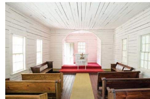
above: Nearly 150 feral horses call Cumberland Island home. left: Founded in 1893, the first African Baptist Church is where JFK Jr. and Carolyn Bessette were married. below left: Old-fashioned Southern charm awaits guests in every room. below right: Read a book, play some chess—the library offers a peaceful retreat.

All guests of the inn have access to a fleet of bicycles to explore the island. There are abandoned mansions, the First African Baptist Church (where the Kennedy wedding occurred) and a few museums. Guided history and nature tours are complimentary for hotel guests. Activities can range from kayaking with dolphins, swimming on a deserted beach