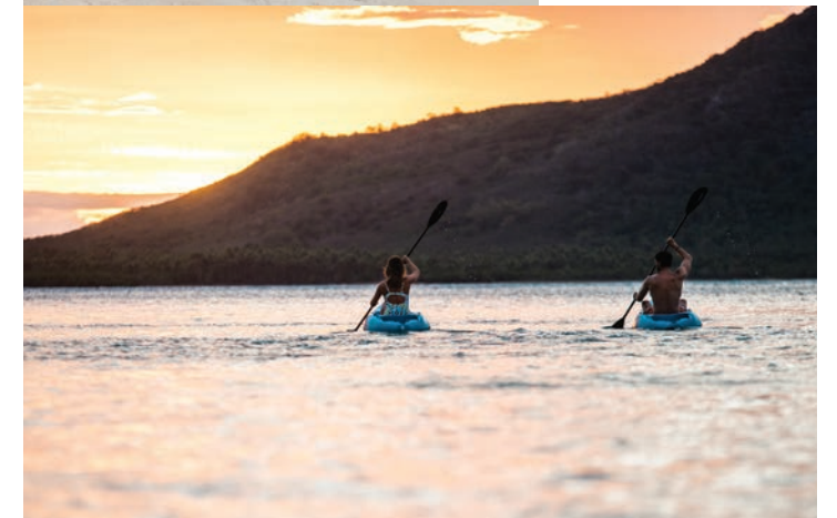
top: Every luxurious villa is appointed with Fijian art and artisan-crafted furnishings. middle: Explore the water’s edge on horseback (taking a break for a champagne toast, of course). bottom: Kayak the serene Blue Lagoon.