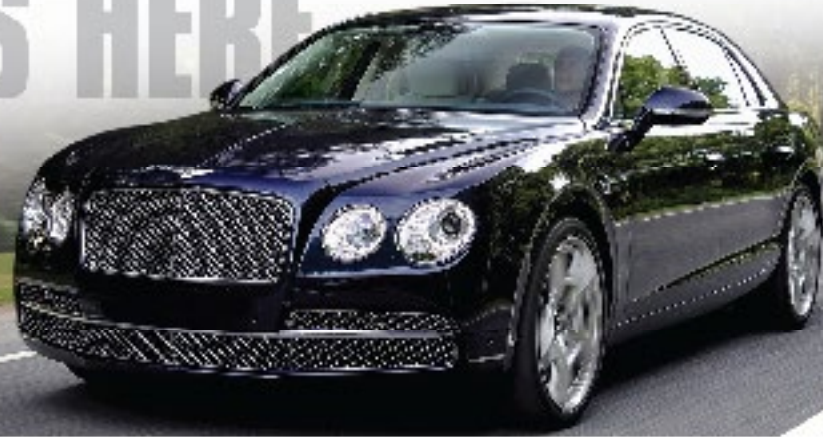
THE NEWEST EDITION Bentley Flying Spur

Bentley Greenwich a division of MILLER MOTORCARS