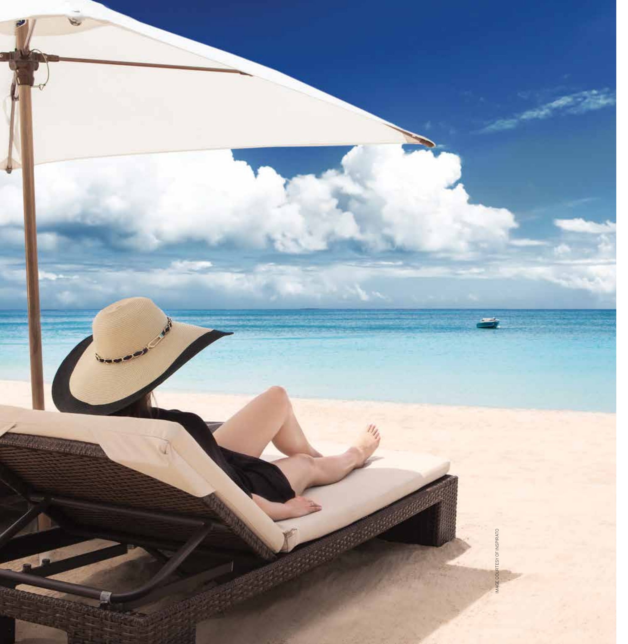
Who needs Calgon, when you've got Inspirato to take you away to the luxe destination of your dreams?