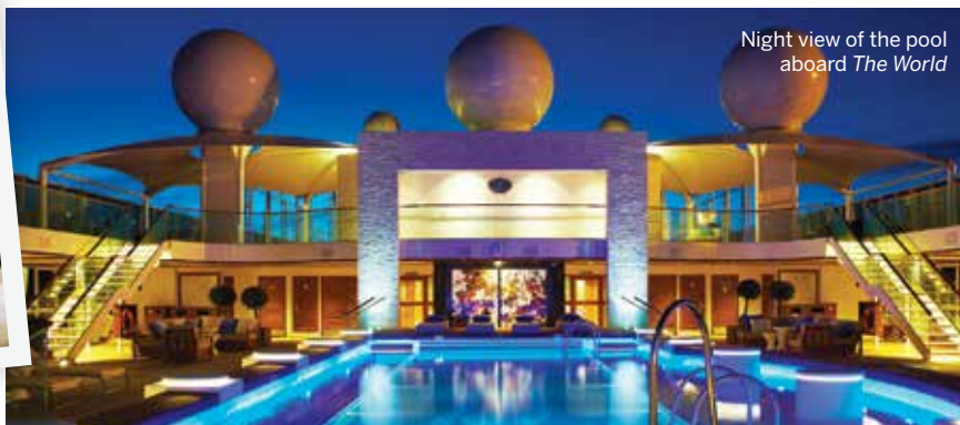
Night view of the pool aboard The World