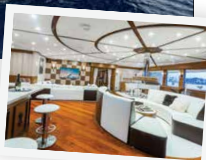
The Legend's interior

Want to live on a yacht and circle the globe continuously? Consider buying a home aboard The World , the only residential