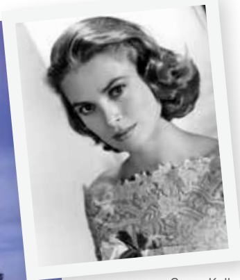
Grace Kelly c. 1954

CABINS: 9 • DECKS: 4 • CREW: 9 + 2 NATURALIST GUIDES