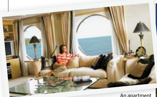
An apartment aboard The World

community at sea. Apartments start at $1.7 million and go up to $16 million. Caveat: You must prove a net worth of $10 million to be considered for ownership. Guests spend as long as they want onboard, with the average owner staying three to six months. Since it launched in 2002, the floating city has visited more than 900 ports in more than 140 countries. aboardtheworld.com