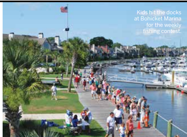
Kids hit the docks at Bohicket Marina for the weekly fishing contest.

The combination of gentle waves and warm water make this an ideal place to learn to surf. Book a private lesson through Carolina Salt Surf Lessons and former pro