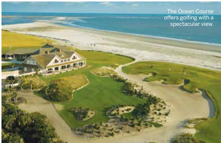
The Ocean Course offers golfing with a spectacular view.

With seven golf courses (five public, two private) on less than ten square miles, Kiawah has become a go-to for the golf set and in 2012 played host to the PGA championships. But if hitting the links isn't your thing, no worries. You can paddleboard with dolphins in the morning, then enjoy a sun-soaked bike ride down the ten-mile beach and settle in for a proper Southern meal by the marsh, where the roasted oysters are delivered by the shovelful and the sweet tea is endless. Here is our beginner's guide to a Southern getaway you won't forget.