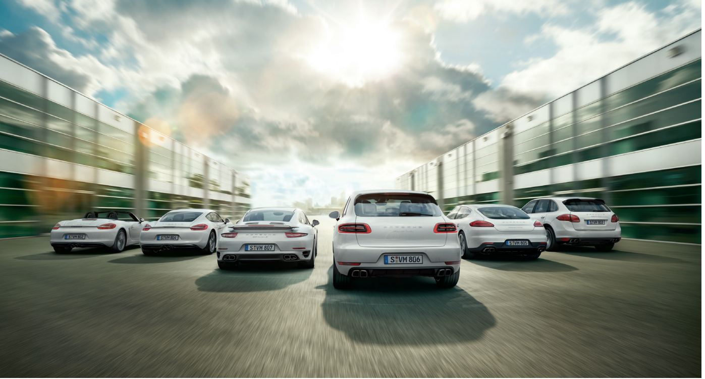
Porsche recommends Mobil 11 and MICHELIN