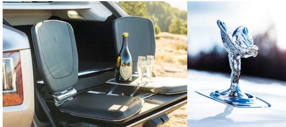
above left: No beach chairs and cooler needed for the Rolls set. above right: Want up-lighting on your maiden? They can do that.

Rolls-Royce didn't want to build an SUV, but it says its customers demanded one. Turns out that Lamborghini, Maserati, Bentley and even Ferrari have all faced the same rallying cry from their discerning clientele. They want to climb rocky mountains and forge deep flowing rivers, but they want to do it in style.