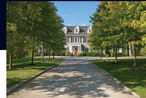
Greenwich Grandeur | Greenwich $9,250,000 | 7 BR, 7.2 BA | Web# 111466

Jennifer Leahy: O 203.622.4900 M 917.699.2783