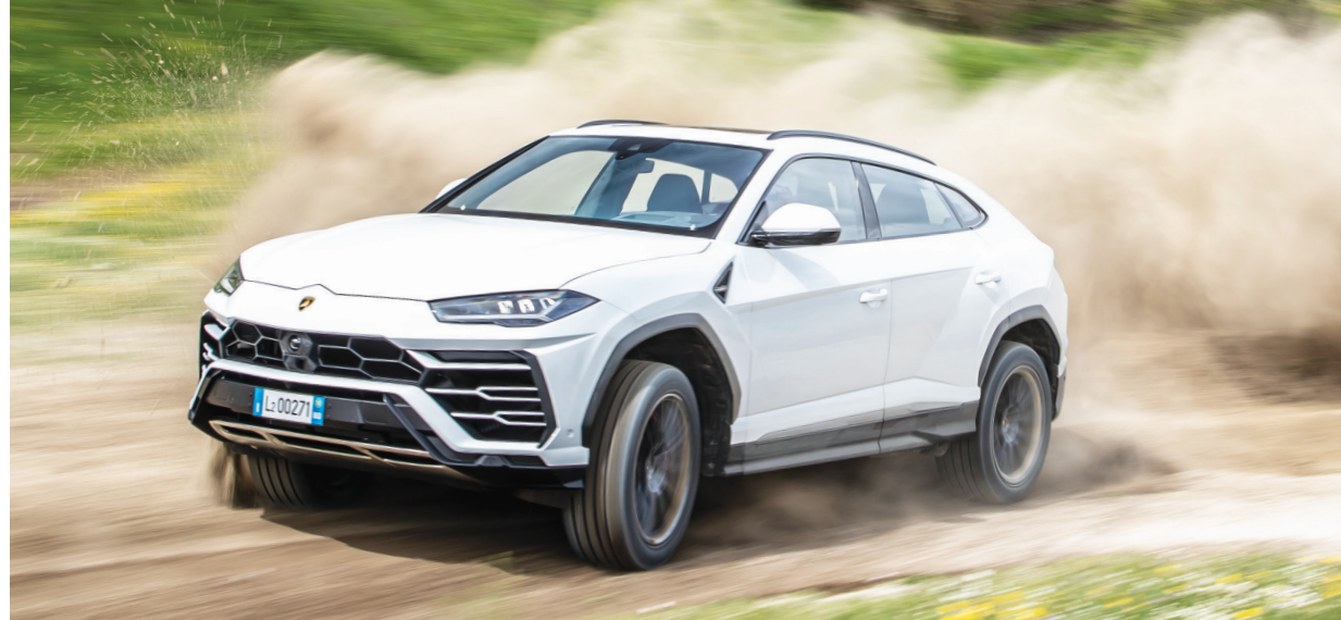
above: Lamborghini Urus offers multiple terrain modes and alerts to make sure your new drivers don't try out the 189 mph max speed. below: Maserati Levante offers leather and silk upholstery from Ermenegildo Zenga. Now that's pretty cool.

The new Ferrari Purosangue (Italian for thoroughbred) is so drooled over by car enthusiasts, and the details kept so secret by Ferrari, that journalists have sourced spy photos and commissioned artists to create mock-ups of what the SUV might look like. It's expected to come in around $300,000 and be a four-seater.