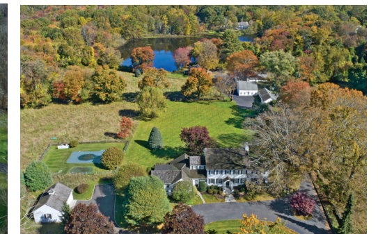
Lakeland Farm Compound | Wilton $3,500,000 | Approx. 30 acres | Web# 170356266