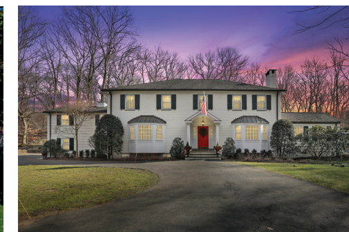
Mid-Country Serenity with Pool | Greenwich $3,249,000 | 6 BR, 4.1 BA | Web# 112029

Jennifer Ho: O 203.622.4900 M 203.536.2628