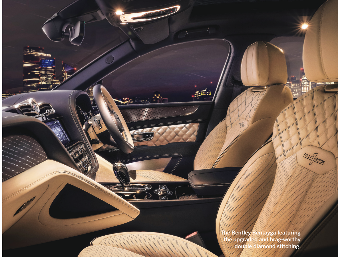
The Bentley Bentayga featuring the upgraded and brag-worthy double diamond stitching.

How fancy are all the interior details? Even the oversized windshield wipers are heated and feature twenty-two washer jets each. The Bentayga starting price is $177,000 , but that, of course, is for an unadorned basic model.