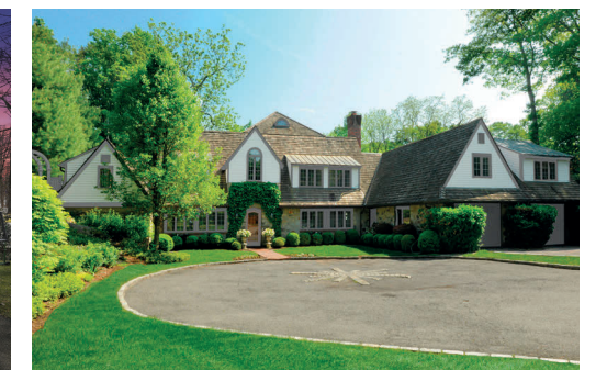
Beautifully Renovated Classic | Greenwich $3,125,000 | 4 BR, 4.2 BA | Web# 112228

Graham Gallagher: O 203.622.4900 M 203.550.0024