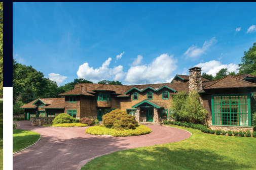
A Robert A.M Stern Masterpiece | Greenwich $7,095,000 | 5 BR, 5.1 BA | Web# 111938