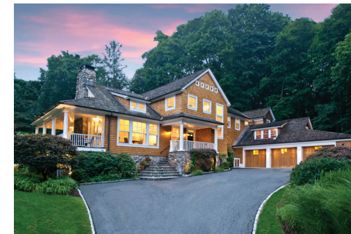
Blending Chic & Classic in Mid-Country | Greenwich $3,995,000 | 5 BR, 4.1 BA | Web# 112006

Monica Webster: O 203.622.4900 M 203.952.5226