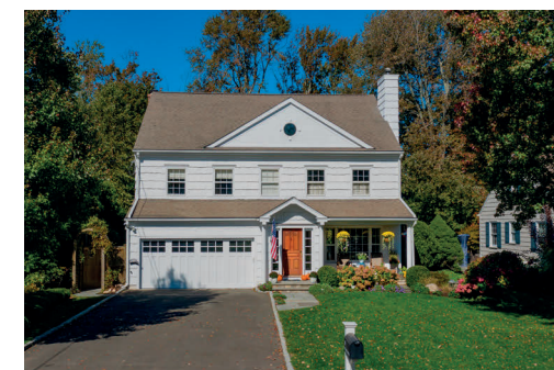
Close to Beach, Transit & Town | Old Greenwich $3,325,000 | 5 BR, 3.1 BA | Web# 112213

Michele Ferguson: O 203.622.4900 M 203.434.3713