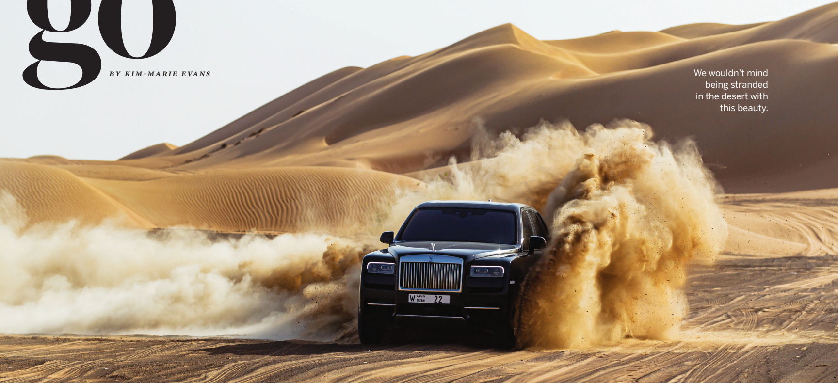
We wouldn't mind being stranded in the desert with this beauty.