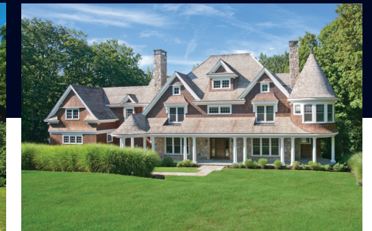
Grand Scale Living | Greenwich $5,450,000 | 6 BR, 5.1 BA | Web# 110112

Jennifer Leahy: O 203.622.4900 M 917.699.2783