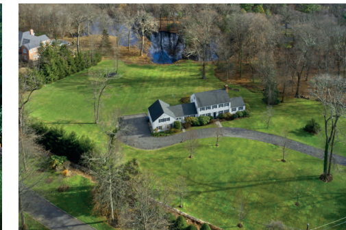
Fantastic Waterfront Opportunity | Greenwich $3,500,000 | Approx. 3.43 acres | Web# 111822

Jennifer Leahy: O 203.622.4900 M 917.699.2783