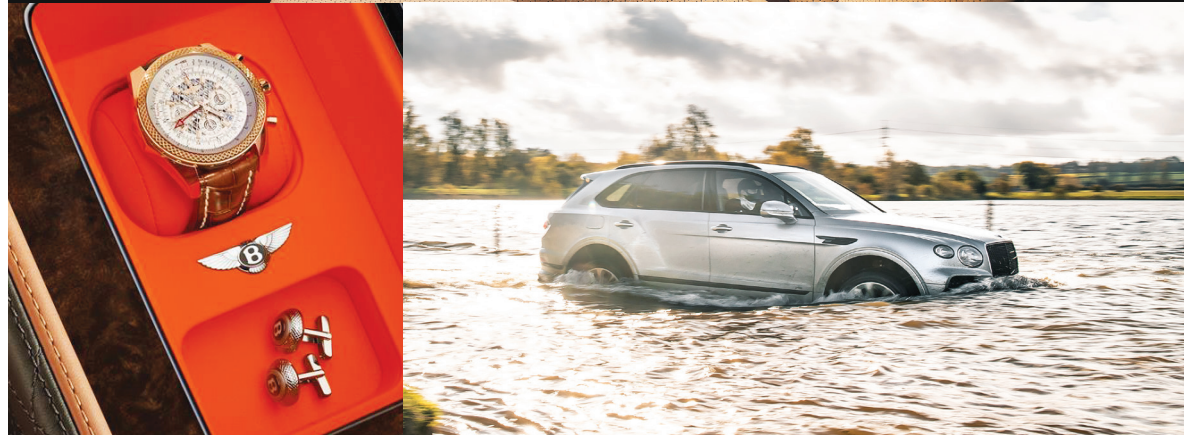
above left: Need a compartment for your baubles? No problem. above right: No problem in flood waters either. below: A very Bentley picnic