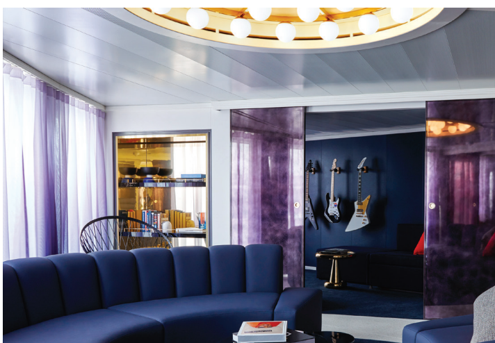
top: The Dock Bar bottom: The living room of the Massive Suite