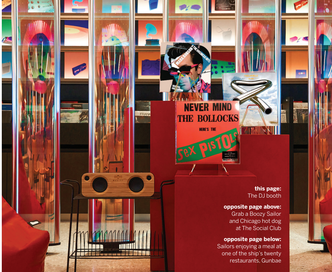
this page: The DJ booth

Virgin Voyages' first ship, Scarlet Lady , will sail from Port Miami for her inaugural season with itineraries to the Caribbean. Virgin Voyages' second ship, Valiant Lady , will sail with seven-night Mediterranean itineraries out of Barcelona, where she recently debuted. Prices vary widely, depending on itinerary, ship and class of cabin.