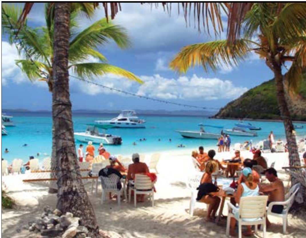
Soggy Dollar Bar, Jost Van Dyke

the morning, paddleboard in to the Cooper Island Beach Club for a latte. The charming town square offers lightning fast Wi-Fi, excellent beach attire shopping and gelato, all in about 500 square feet of space. Not only do yachties love it. So do sea turtles, and there is a better than average chance of swimming with a few. (Turtles, not yachties.)